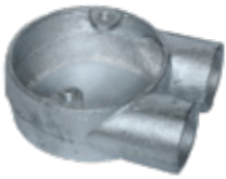
Branch Two Way (U) Part No.: KBJ 02U/20, KBJ 02U/25 Size: 20mm 25mm

Malleable Iron HDG after Manufacture or Black Enamel Fixing Centres: 50.8mm, M4 Internal Dia: 60.3mm Depth(min): 20mm boxes - 25mm 25mm boxes - 28mm