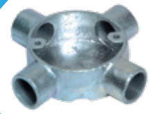
Intersection (4 Way) Part No.: KBC20, KBC25, KBC32 Size: 20mm 25mm 32mm