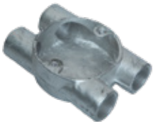
Twin Through Way (H) Part No.: KBJ 04H/20, KBJ 04H/25 Size: 20mm 25mm