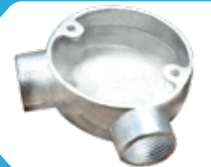
Angle (A Way) Part No.: KBC20, KBC25, KBC32 Size: 20mm 25mm 32mm