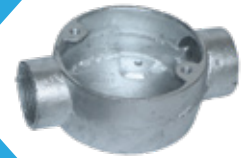
Through (2 Way) Part No.: KBC20, KBC25, KBC32 Size: 20mm 25mm 32mm