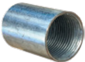
G.I. Coupler Part No.: KBC20, KBC25, KBC32 Size: 20mm 25mm 32mm