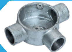
Tee (3 Way) Part No.: KBC20, KBC25, KBC32 Size: 20mm 25mm 32mm