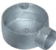
Terminal (1 Way) Part No.: KBC20, KBC25, KBC32 Size: 20mm 25mm 32mm