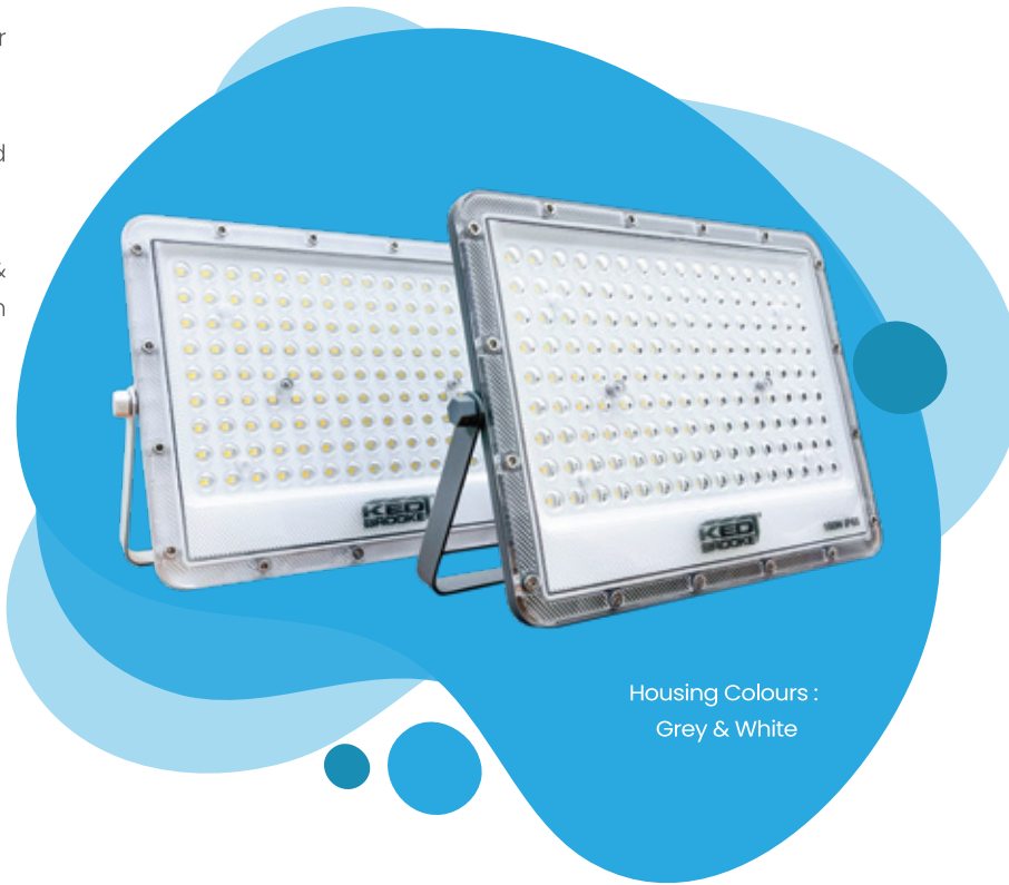
Housing Colours : Grey & White